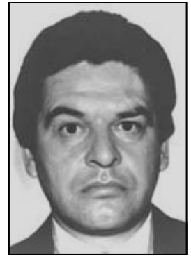
DEA Agent, Kiki Camarena

Businesses, the media, social service agencies, governments, schools, service organizations, religious institutions, safety forces, and individuals will demonstrate their commitment to a drug-free lifestyle by wearing and displaying red ribbons or drug free bracelets during this week-long celebration.